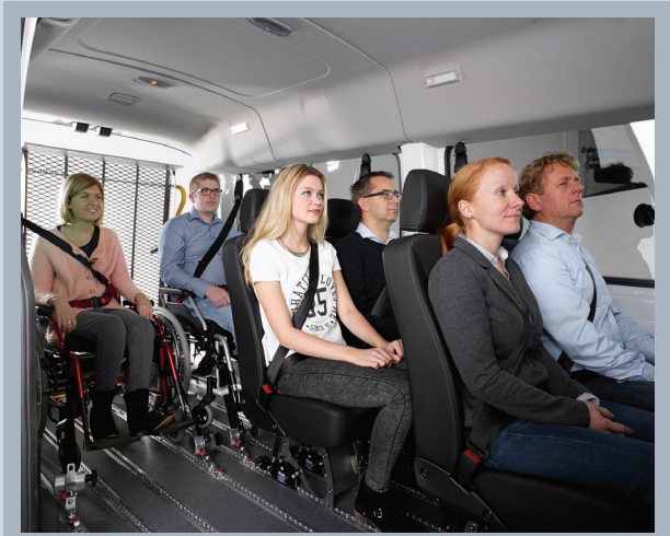
Smartfloor provides flexibility inside your vehicle.