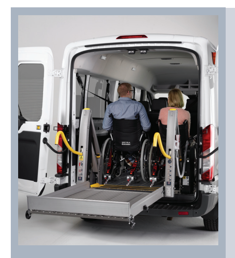
Worldwide unique design due to the specially manufactured aluminium profile lifting arms.